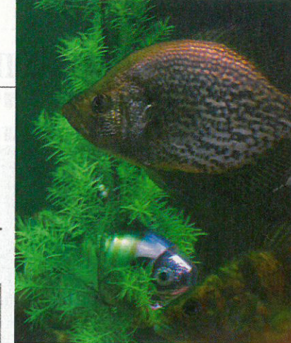
Camera Cable Structure.

of these busy areas in slightly deeper water and set my Reel Weeds. The hordes of anglers push fish out of busy holes to linger over nearby featureless water—except it's no longer featureless. I've added my own cover and am quietly catching more fish.