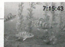
Time-lapse video shots showing the effect of Reel Weeds.